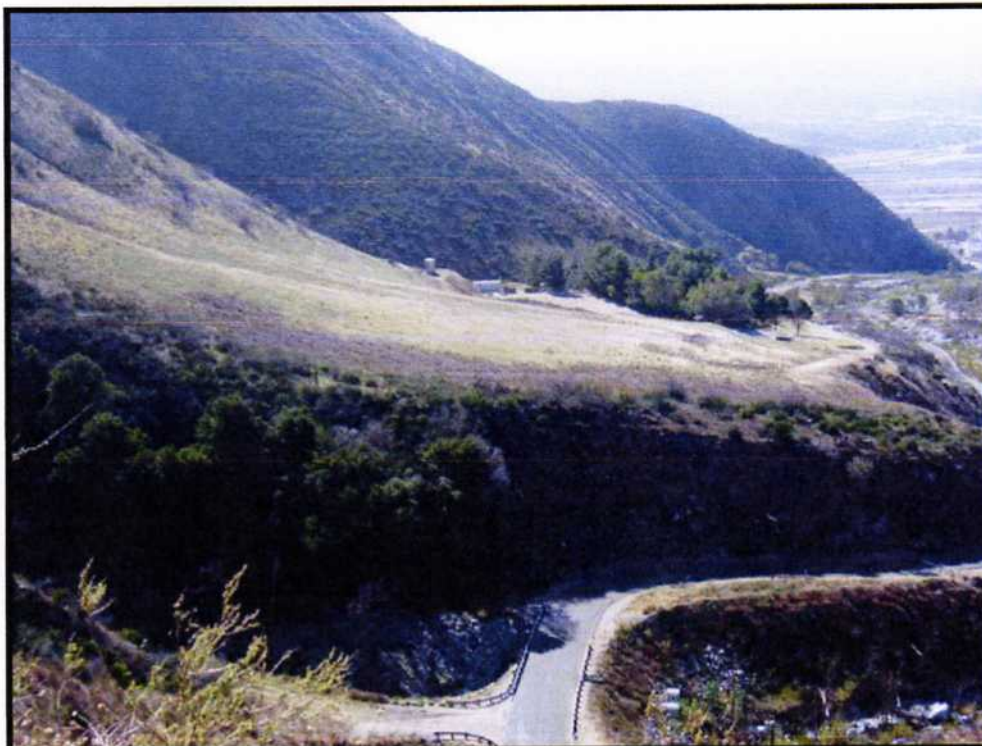
Photo 4: View south – East Fork of Devil Canyon Creek (foreground) and Pine Creek Resort (background).