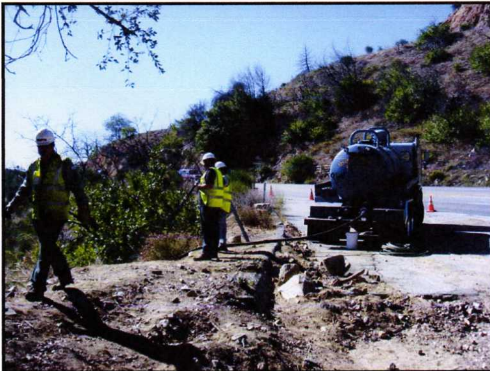
Photo 16: October 20, 2006 Remedial action at Highway 18 spill site - HMHTTC Vacuum Truck with Liquid Remediate™ at top of Ravine.